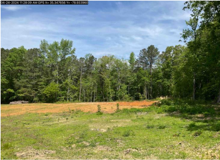
Site / 7932 NC 27 W