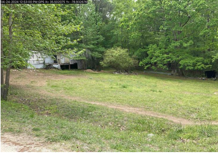
Site /144 Royal St.